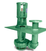
Vertical Process Pumps