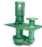
Vertical Access Pumps